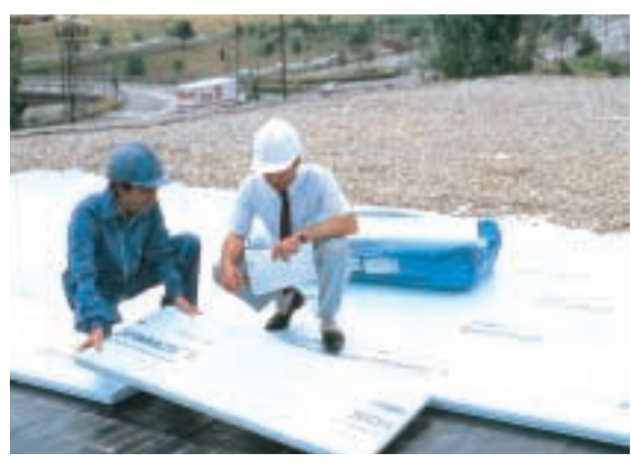
Ballasted Upside-Down roofing

The long term thermal resistance of an insulation material is essential for both building owners and designers. With its excellent moisture resistance and thermal performance retention properties, STYROFOAM ROOFMATE is the ideal insulation material for Upside-Down roofing, while STYROFOAM DECKMATE is the perfect choice for single-ply roofing.