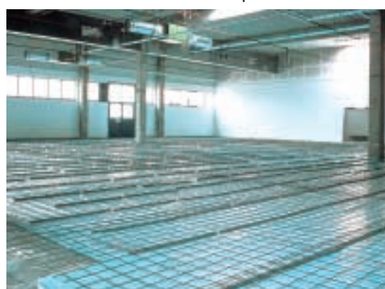
Sandwich panel and floor